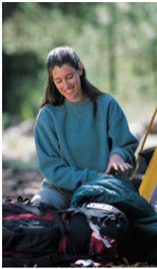
Campsite will be setup by group participants.

There will be opportunities for hiking, camp & meal preparation & yes, some fun in the days outdoors. You will be provided with all the necessary gear for your excursion on the southwest trail. A packet with information on gear, meals, safety, & curriculum will be